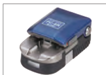
Handy cleaver FC-8R series