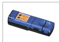
Hot jacket remover JR-6+