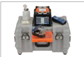
Carrying case with worktable CC-72