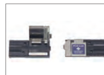
Pitch changing holder PCH-12A