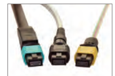
Available for Lynx-Custom Fit™ Splice-On Connector