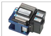
Table-top cleaver FC-6 / FC-6R series